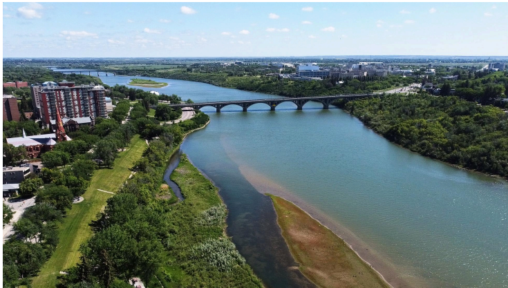
Figure 2 A picture is treated in the same way as diagram. Paragraph formatting was used to ensure the picture and caption appear together.